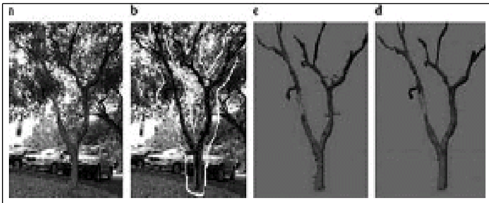
Fig. 1. Data collection: Photography and image processing and analysis

For this purpose, a simple low-cost digital camera and an image processing software (like Adobe's Photoshop CS2) could be used.