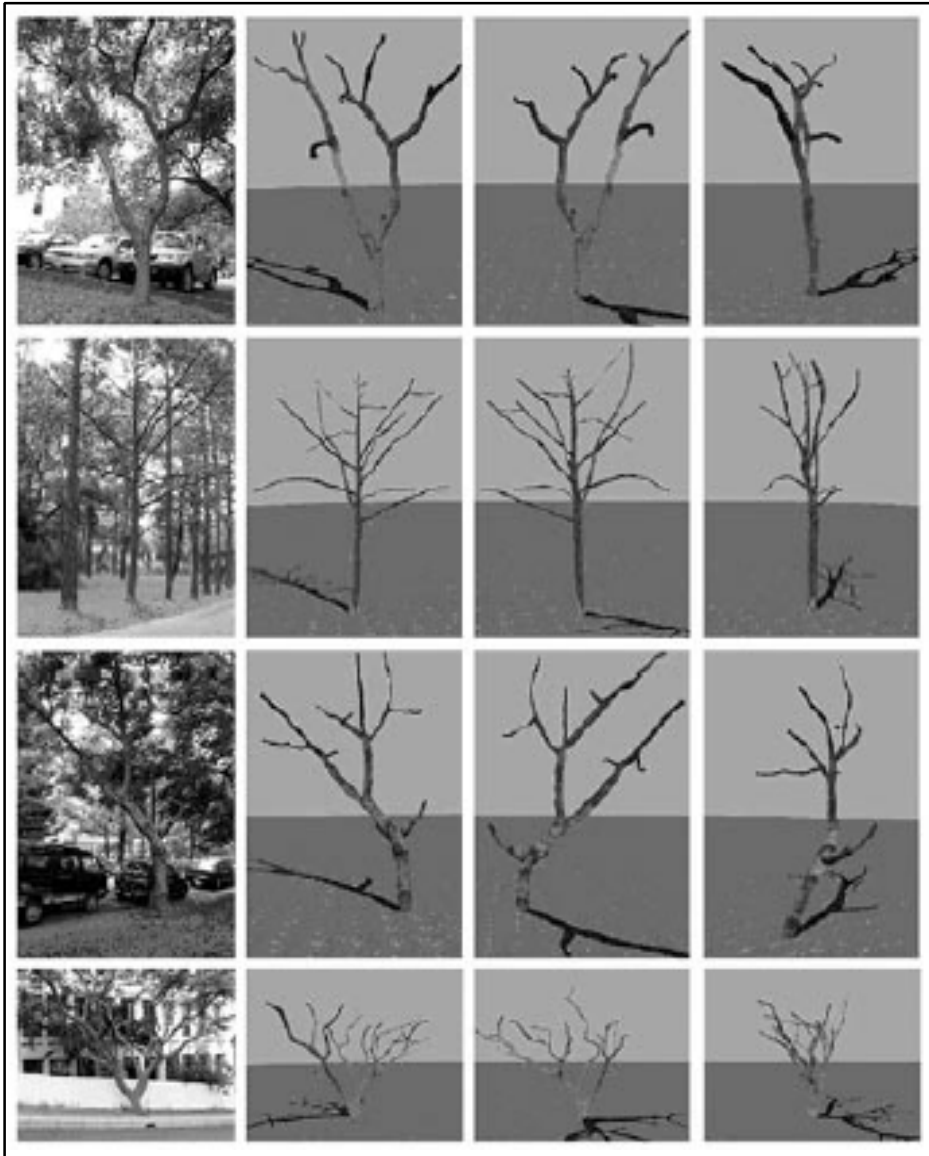
Fig. 4. A landscape database record related to a tree (field amateur photography and tree-trunk 3D modeling)

This stream operates as an integration platform for the entire digital image-based environment (incorporating: environment understanding, real-time user interaction and visualization, and management). Also, this stream could include system's operation manual and teaching materials.