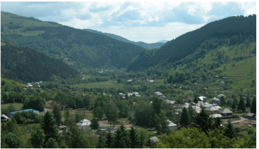
Fig. 1. Appearance in the Apuseni Mountains

A. Village Bistra is one of the oldest settlements on Aries Valley, being first mentioned in 1437 as "princely village" and known since the time of King Carol Robert of Anjou. Village name comes from the Slavic word bistra which means "clear water".